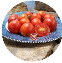
Dwarf 42-Day Page 7