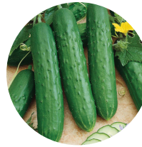
Spacemaster 80 Page 16

No Garden? No Problem! Ask us how to grow plants in containers on your porch, deck, or patio!