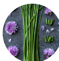
Chives Page 12