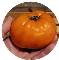
Dwarf Gloria's Treat Page 7