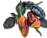
Puma Page 8