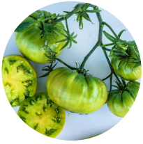
Aunt Ruby's German Green Page 3