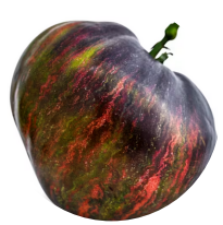
Rebel Starfighter Prime Page 5