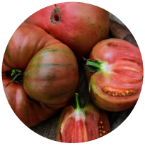
Dester Page 4