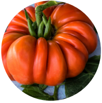
Burmese Sour Tomato Page 3