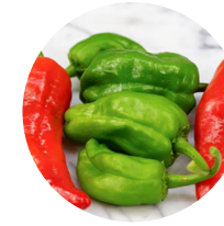
Pimiento de Padron Page 10