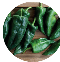
Trident Poblano Page 10